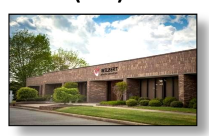
Easley SC Facility (ESC)